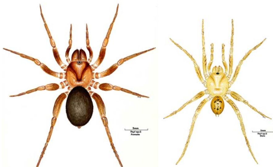
Illustration of a female (left) and a male (right) Minnivale Trapdoor Spider ( Brad Durrant )